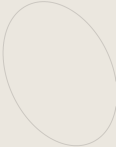
TexOpaque™ is a trademark of Altex®.

Bacteria & Fungal Resistance (colours 6000-02 and 6000-07D): ASTM G-21